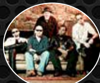
THE FABULOUS THUNDERBIRDS