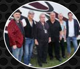
DOWNCHILD BLUES BAND