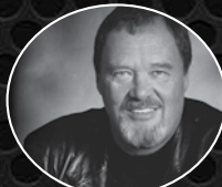
DAVID CLAYTON THOMAS