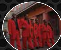
THE BLIND BOYS OF ALABAMA