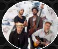
THE BLACKBURN BROTHERS