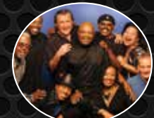
THE FUNK BROTHERS